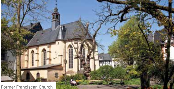
Former Franciscan Church