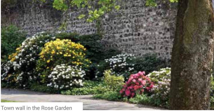
Town wall in the Rose Garden