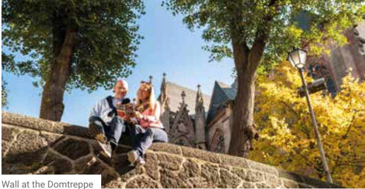
Wall at the Domtreppe

was replaced with a Lutheran church with a beautiful Rococo interior and a pulpit-altar designed to integrate pulpit and altar into one architectural element, giving equal emphasis to promulgation of the Word and the sacrament.