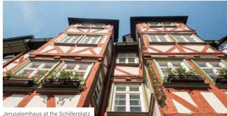
Jerusalemhaus at the Schillerplatz

Numerous young lawyers were to be found at the Imperial Chamber of Justice, the supreme German court, that had its seat in Wetzlar from 1689/1690 to 1806. Here they were expected to complete their education and gain practical experience. One such budding young lawyer was Johann Wolfgang Goethe, who arrived in this "capital of jurisprudence" on May 10, 1772, which he found to lack the enticing flair of the university towns he had known up to then.