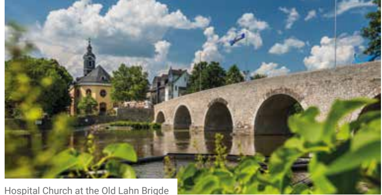
Hospital Church at the Old Lahn Bridge

The current building was erected in 1716. Before that, one of Wetzlar's five mediaeval breweries stood here, with a malt house behind it. Both buildings have gabled fronts facing west which were built directly on top of the town wall.